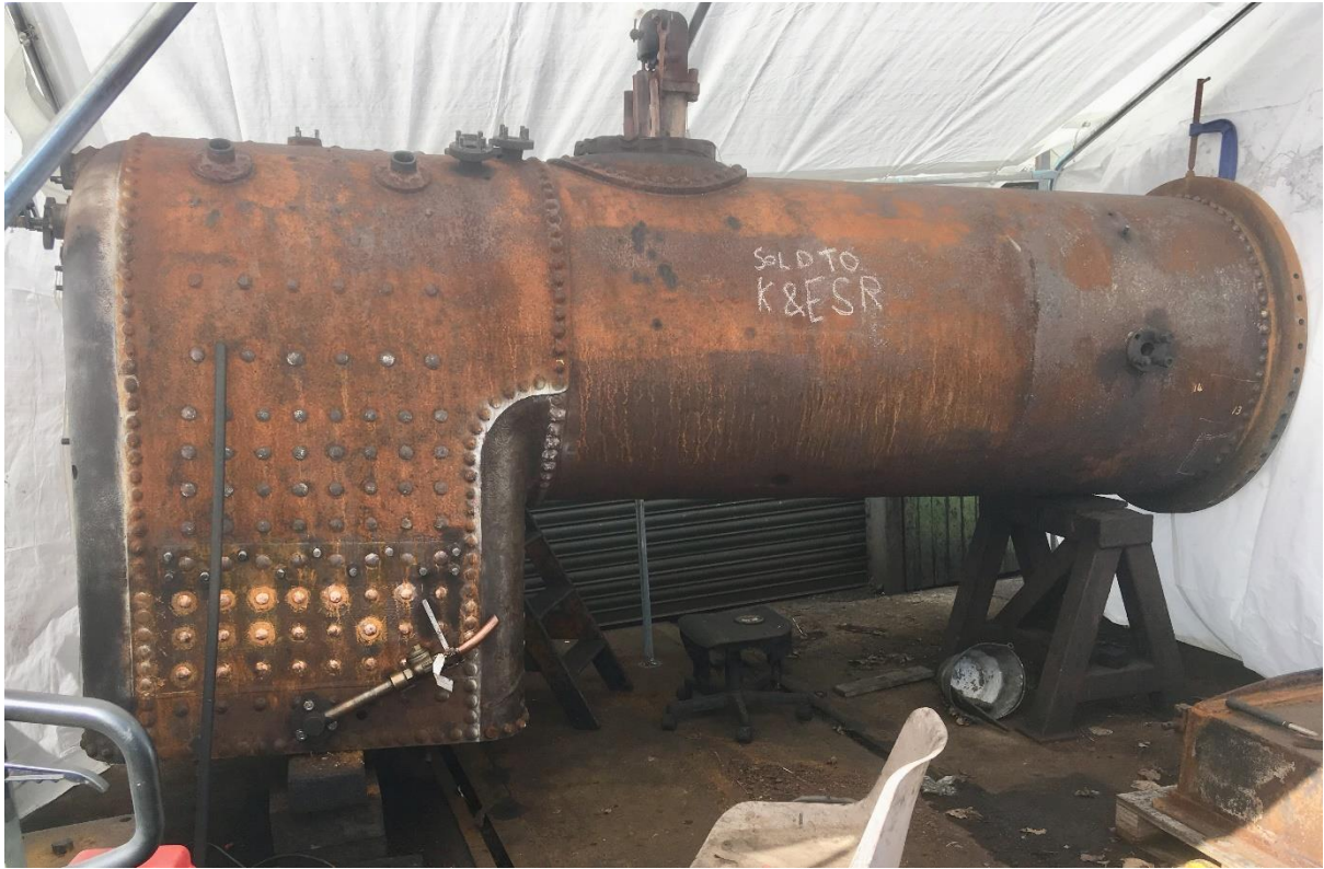
The boiler under its weather cover outside Rolvenden loco shed.