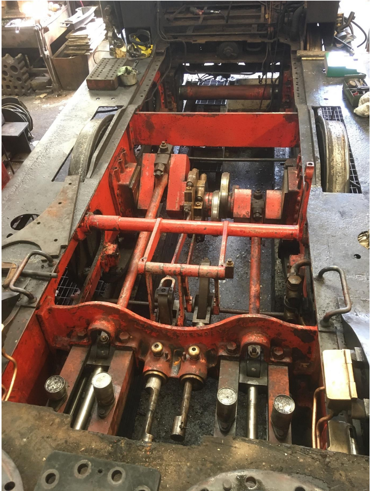
Frames from front to back.